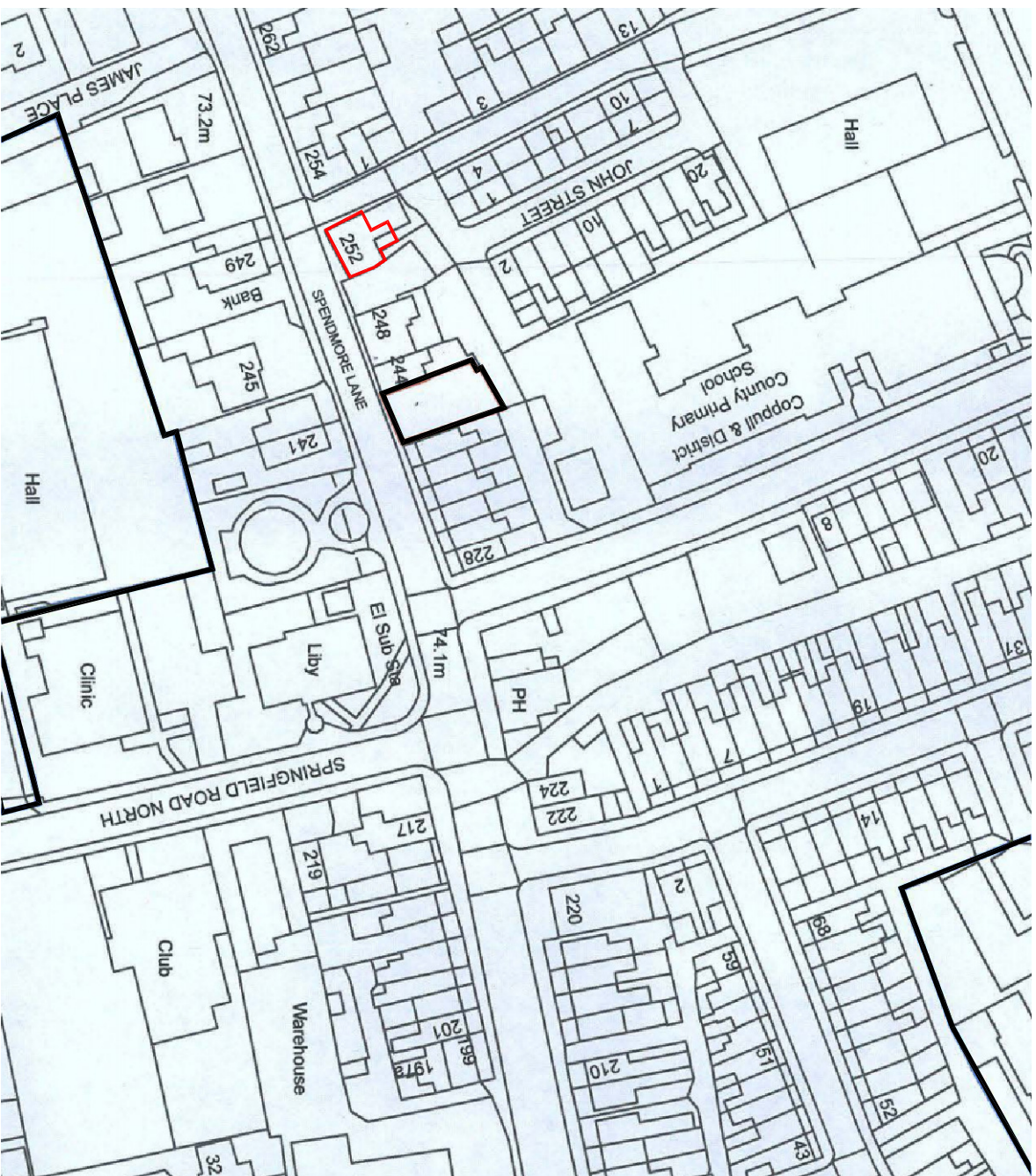
Site location plan - 1:1250